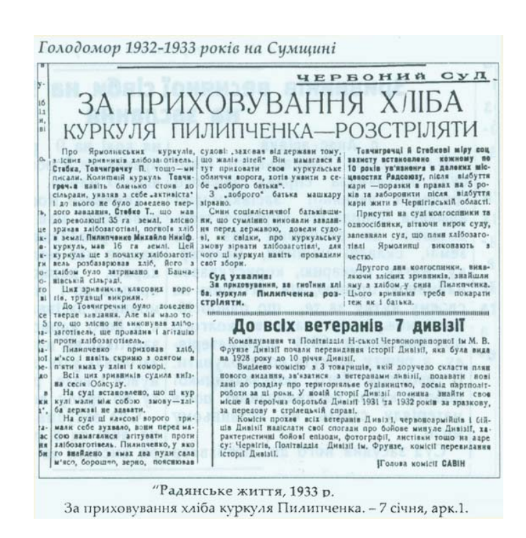
Top: "Source unknown." Starving people in Ukraine, 1930s. Photo published in "Rodina" (no. 1, 2007). Bottom: "Kulak Pylypchenko to be executed for hiding grain" ("Soviet Life," local newspaper, Sumy oblast, 7 January 1933).