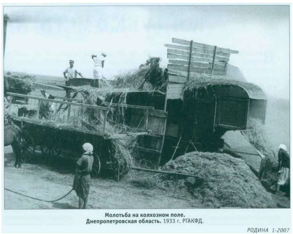
Both photos supposedly depict the pastoral life of collective farmers in Dnipropetrovs'k oblast, 1933.